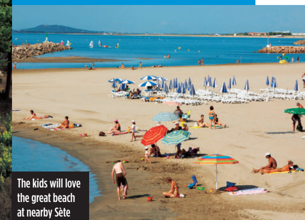
The kids will love the great beach at nearby Sète