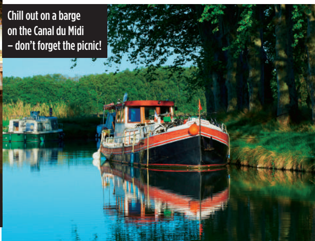
WORDS: RACHAEL MARTIN

winding cobbled streets. Bikes are available to guests at the château for free, but you can also take to the countryside trails on foot to immerse yourself in a landscape of rolling hills and wildflowers. For something even more genteel, an afternoon floating on the Canal du Midi on a barge with a picnic lunch couldn't be more perfect. Prices from £7pp, book through the concierge service.