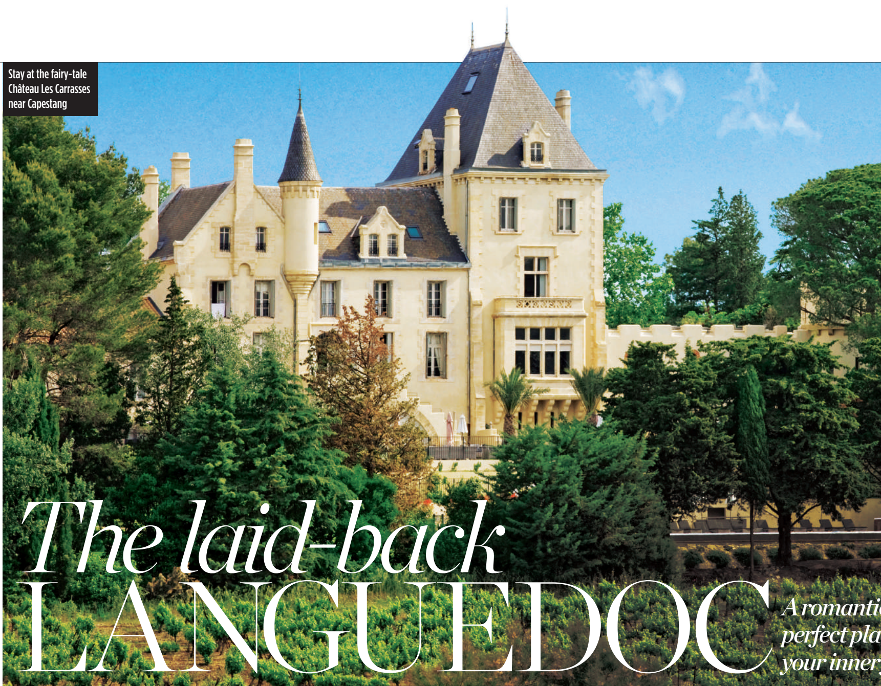
Stay at the fairy-tale Château Les Carrasses near Capestang