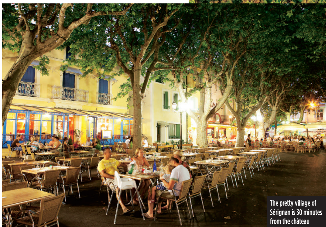
The pretty village of Sérignan is 30 minutes from the château