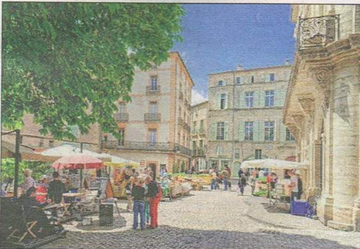
Picture perfect: the market in the historic town of Pezenas sells fruit, vegetables, flowers and artisan food

Ryanair flies from Stansted to Carcassonne, returns from €45, ryanair.com. Two-nights in a Chateau Suite from €279 (based on two sharing) B&B with one three-course dinner in the Brasserie. Valid from November 1, 2014, to March 31, 2015 (excludes Christmas, New Year and February 14),lescarrasses.com