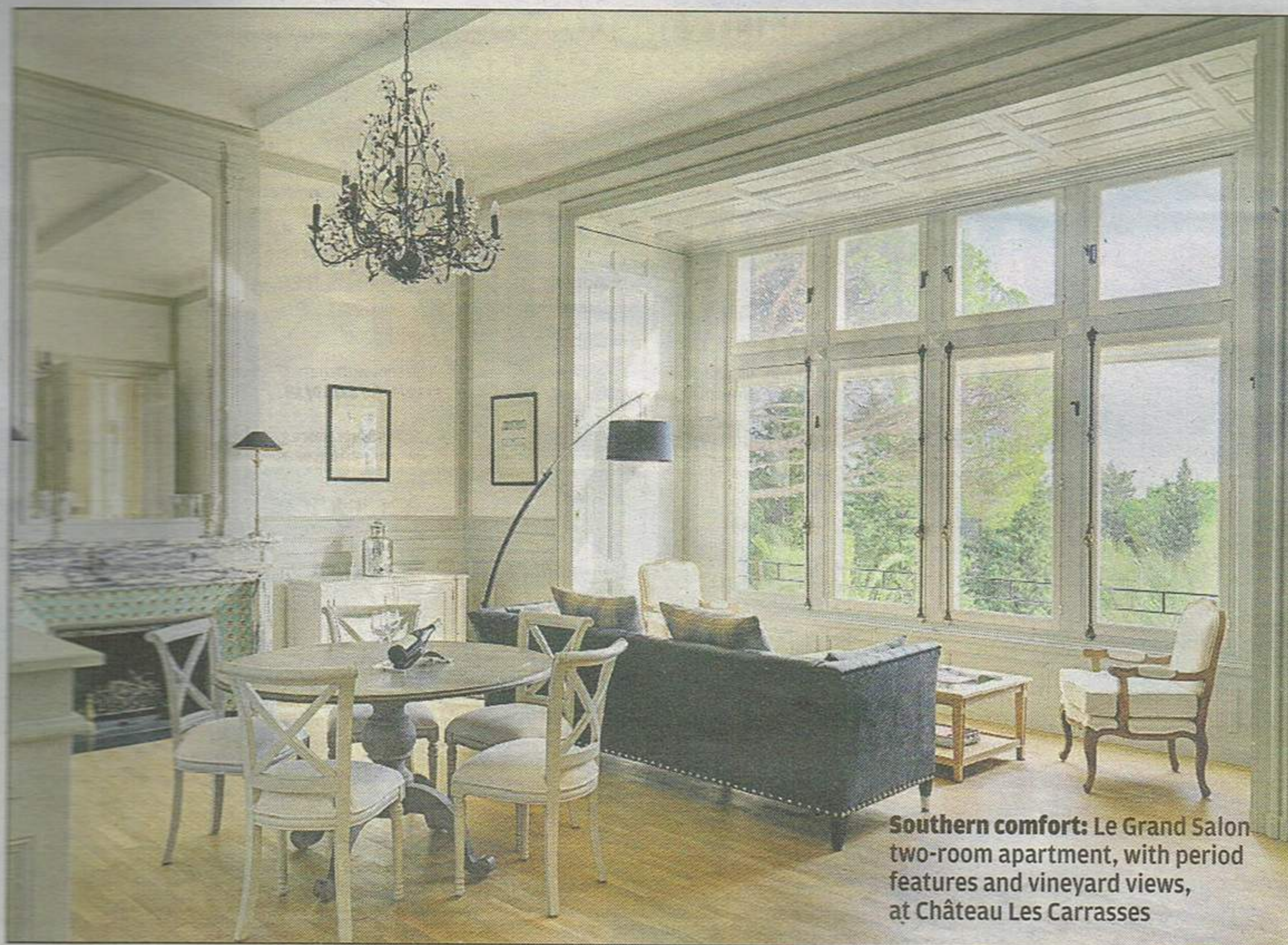
Southern comfort: Le Grand Salon two-room apartment, with period features and vineyard views, at Château Les Carrasses

After rumbling through the vineyards we reached the château with its stunning limestone turret. Les Carrasses opened in 2011, but its 28 suites, apartments and villas, all with well-equipped kitchens and barbecues and many with gardens and azure pools, still look brand