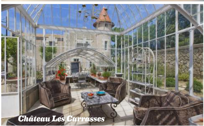
Château Les Carrasses