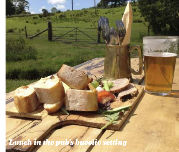
Lunch in the pub's bucolic setting

Little Cwm Colebatch sleeps 6; rental costs from £785 for 3 nights (sheepskinlife.com). olive offer: Book 4 nights and receive 10% off a stay at any Sheepskin property. Standard T&Cs apply. Book by 31 October, valid until 31 January 2015. Please quote olive magazine when booking