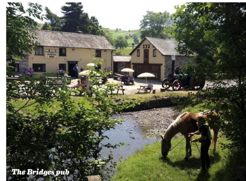
The Bridges pub

Just out of town is the Ludlow Food Centre (ludlowfoodcentre.co.uk), an earnest if slightly sterile showcase for the county's produce. We've had enough booze cruising, we decide. Instead we stock up here on everything we need to make slow-baked sausages in the Aga (including a bottle of Postman's Knock rich ruby porter from another local brewery, Hobsons) and head back to our country idyll. ☺